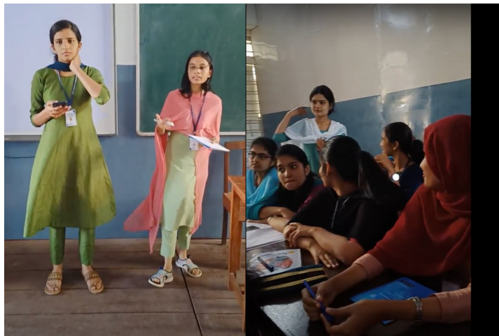
Discussion on Climate Change